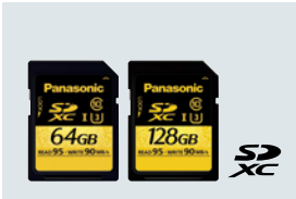
SDHC/SDXC Memory Card