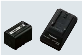
VW-VBD58 (5,800 mAh) Battery Pack AG-B23 Battery Charger