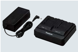
AG-BRD50 Battery Charger