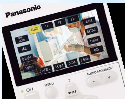
Touch Panel LCD (User Button Setting Example)