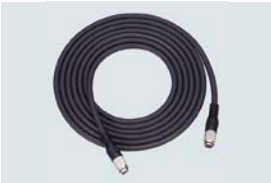
AG-C20003G 3 m (9.84 ft) AG-C20020G 20 m (65.62 ft) Camera Head Option Cable