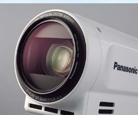
Lens Protector (Standard Equipment)