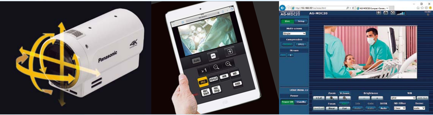
Five-Axis Hybrid Image Stabilizer Diagram