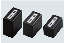
AG-VBR118G (11,800 mAh) AG-VBR89G (8,850 mAh) AG-VBR59 (5,900 mAh) Battery Pack