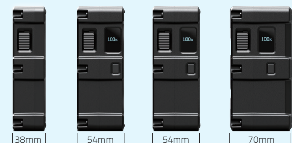
BIVO-98 98Wh BIVO-160 160Wh BIVO-200 196Wh BIVO-290 290Wh